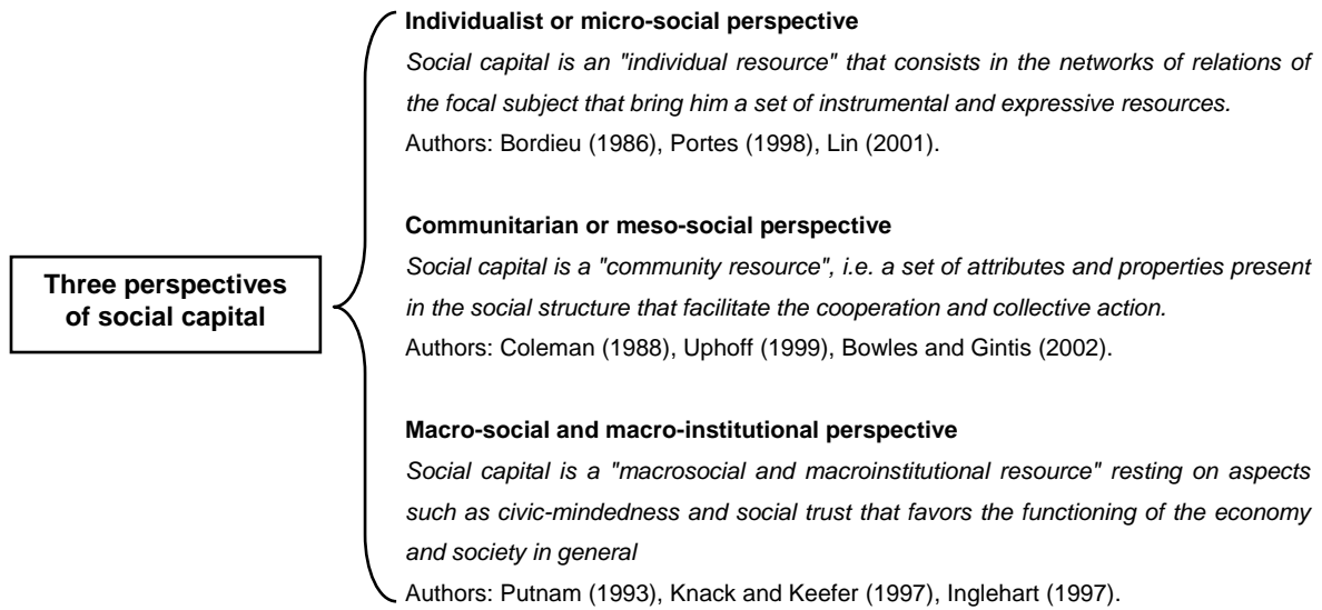
Figure 2. The three perspectives of social capital.

This division into three approaches corresponds to the triple cataloging of social capital as "individual good", as "collective good" and as "public good" (Putnam, 1993, 2000; Adler and Kwon, 2002, p. 22; Dasgupta, 2005; Sánchez-Santos and Pena-López, 2005). That is, social capital generates returns for the individual, for the group and for the whole of society.